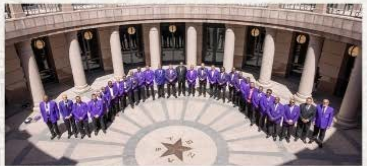
Omega Psi Phi Fraternity visiting the Capitol