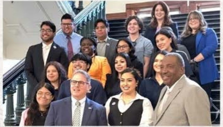
UNT Dallas students visiting the Capitol.