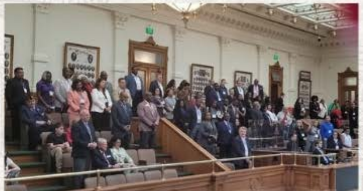
Best SW Chamber Partnership & Leadership Southwest at the Capitol.