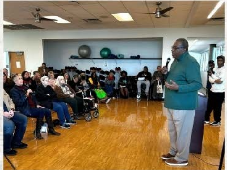
Senator West at Town Hall Meeting.

There were quite a few current and retired teachers in the audience with lively discussion and many poignant questions.