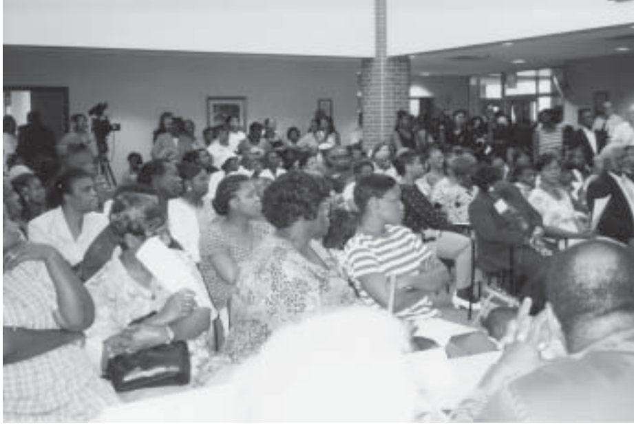
Residents of West Dallas attend one of Senator West's Town Hall meeting focusing on contamination in West Dallas"

RSR Superfund Clean-Up: The process of tearing down the old RSR smelter site is underway. Work began in November 2000 and should be finished in April 2001. ENTACT, Inc. has been hired to dismantle and clean up the RSR site. During the clean up, air monitoring sites have been set up through-