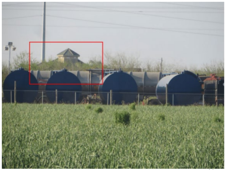
*Transloading facility located in Pharr, Texas<sup>31</sup>

CID alongside DPS are also monitoring the dangerous scene unfolding with unregulated fuel depots popping up throughout the border region. Unregulated fuel depots are being used to store and transfer fuel between fuel tanks, fracking tanks, and fuel storage tanks. CPA does not currently have any permitting requirements to regulate such depots, nor does CID have the ability to track activity occurring inside. These transloading facilities provide the opportunity for nefarious actors to circumvent motor fuel tax law and pose significant danger to the public. Many of these facilities are located in close proximity to residential areas and the process of transloading can cause leakage of fuel that contaminates the surrounding agriculture.