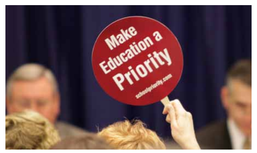
A major function of Governmental Relations is to promote TASB's Advocacy Agenda.