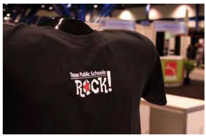
The TASB Store travels to SLI and the TASA/TASB Convention.

Our online store has a large selection of TASB-produced books and video packages covering topics of interest to board members, administrators, parents, and community members. Shopping is easy, with items grouped by category. Recent items are displayed on a special "featured products" page. A gifts category includes novelty and